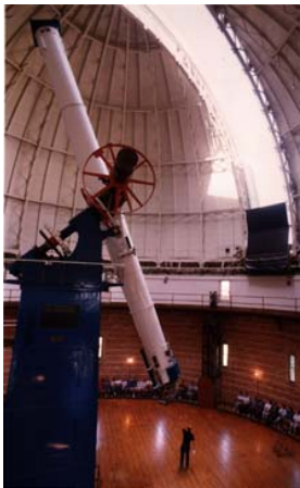
The 40-inch refractor at the Yerkes Observatory set out to be the largest telescope in the world when construction began in 1890. Today, it still is the largest. A special dome and floor had to be custom built for the telescope.

Astronomers used the new telescope to make better observations.